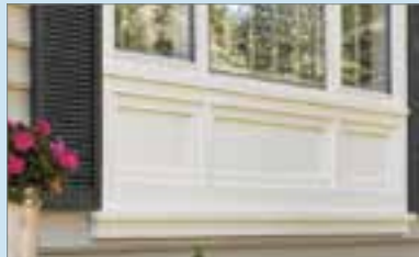
PVC Exterior Trim & Beadboard