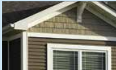
Vinyl Carpentry® Trim