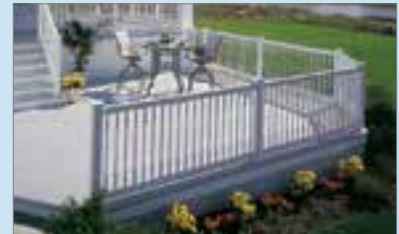
Decking and Railing