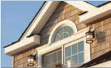
Polymer Shakes & Shingles

CertainTeed products are designed to work together and complement each other in color and style to give your home a beautiful finished look.