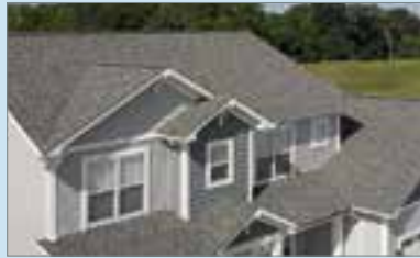
Roofing and Ventilation