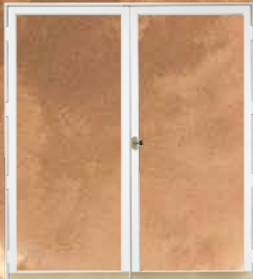
All Door Styles Available in French Door Configuration