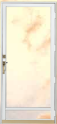
F490 Phoenix I