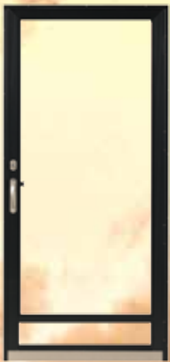
F498 Phoenix III