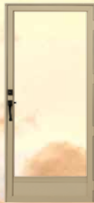
F495 Phoenix II