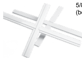
5/8" Flat Grid (between the glass)

Flat and sculptured grids are available in standard and custom patterns.