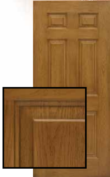
Legacy™ 20-gauge Woodgrain Textured Steel