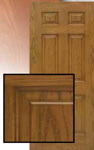
Legacy™ 22-gauge Woodgrain Textured Steel

Photos above are intended to show the variations in woodgrain texture and pattern. Swatches below are not intended for final color selection. Ask to see a Stain Selector for accurate color representation.